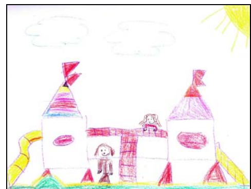
"At the park with mom"