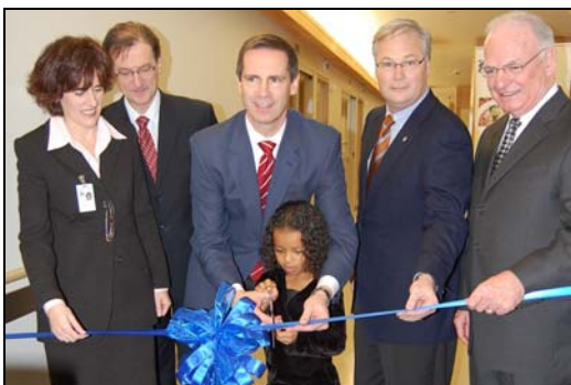
Official opening of the expanded Ottawa Hospital Cancer Centre at the General Campus